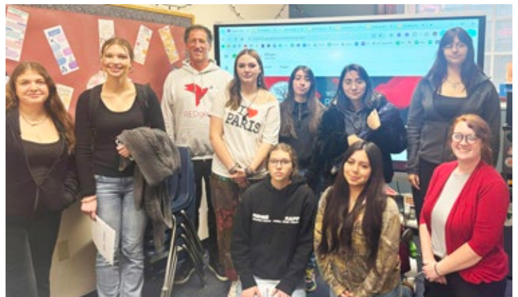
REDgen was launched for Veritas and both Tenor campuses