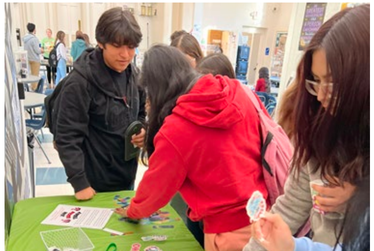
Seeds of Health high school students and staff participated in World Mental Health Day.